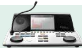
AD629 Diagnostic audiometer