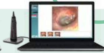
Viot™ Video otoscope