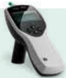
MT10 Handheld tympanometer