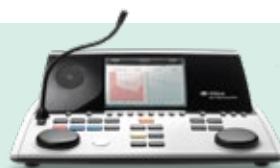
AD629 Diagnostic audiometer