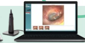
Viot™ Video otoscope