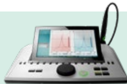
AT235 Middle ear analyzer